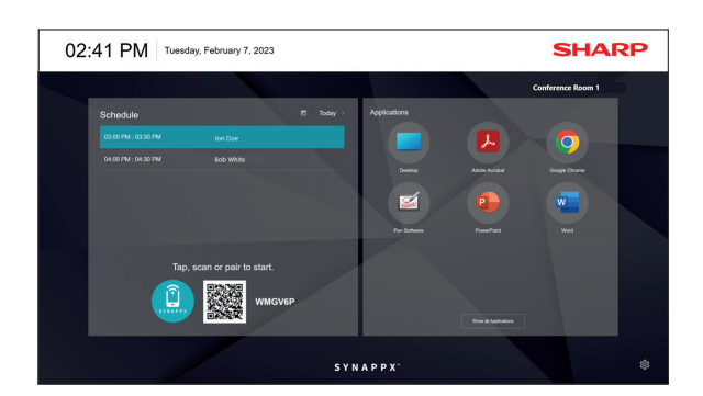
Kiosk mode shows scheduled meetings.

You can use Kiosk mode to fully customise and control the meeting room display content. A list of meetings scheduled to take place in the room is conveniently shown on the inroom display along with shortcuts to various productivity applications and tools that can be used during each meeting.