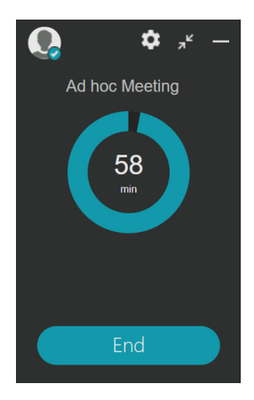
\boldsymbol{A} visual reminder of meeting time remaining.

The Synappx Meeting Assistant shows a visual timer for the meeting allowing you to keep track of the time remaining. If you need more time, you can extend the meeting with a simple tap (as long as the room is not already booked) and your calendar will automatically update to reflect the additional time added.